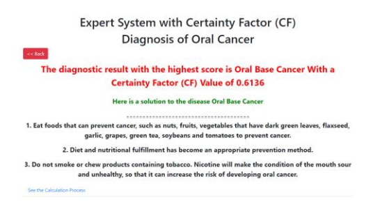
Figure 4. Display of Diagnostic Results

After the user selects the symptoms experienced, the system will display the results of the diagnosis. The display of the diagnosis results can be seen in Figure 4. From the display the system will display the disease and solutions based on each symptom and level of confidence in the questions that have been previously inputted by the user. The admin as the website manager can manage symptoms, diseases, expert rules and the weight of the level of trust as well as disease handling solutions.