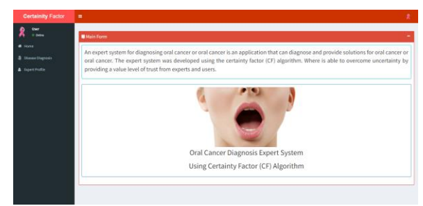
Figure 2. Main Menu Display of Expert System Applications

System users who will diagnose can choose the symptoms experienced and enter the user's level of trust according to what is felt. Then the system converts it into a value (weight) of the degree of confidence. Figure 3 below is a GUI display from the disease diagnosis page.